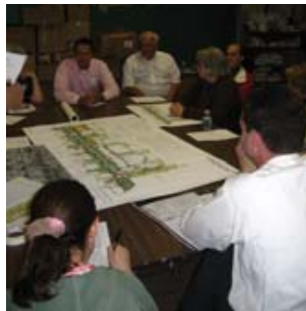
Workshop participants discussing the South Main Streetscape

In addition to the large public workshops, a series of smaller focus group sessions were conducted to gain insight into specific issues of key concern including parking and parking management (sponsored by the New York Metropolitan Transportation Council), streetscape design, the local businesses community (opportunities for promotion and economic development), the Central Gateway area (Main Street intersection with New City – Congers and New Hempstead), and the Rockland County Campus.