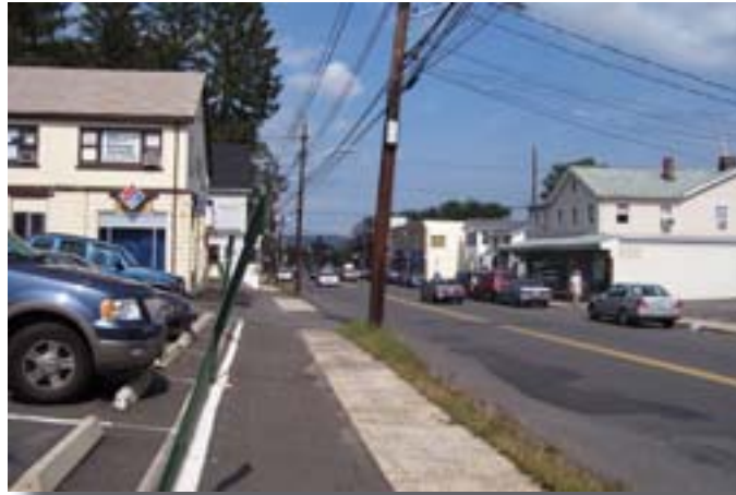
South Main Street in New City

interested in the plan and participating in the meeting: “Let’s make New City a place to be proud of!”