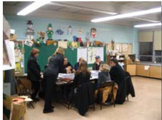
Residents working together to plan for New City's future