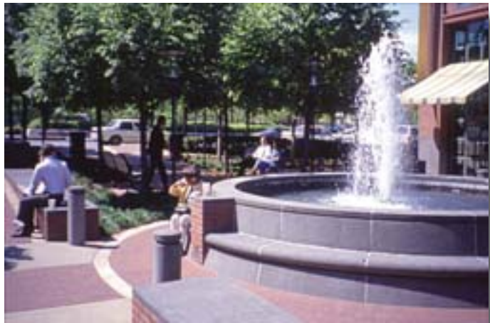
Workshop participants selected these two images from other communities as their favorites during an image preference survey at the first workshop in March 2006

Surrounding neighborhoods will benefit by renewal of the Hamlet Center by being within walking distance of shops, restaurants, businesses, the courthouse, government offices, parks and other activity centers. New development will be sensitive to the existing neighborhoods and carefully designed to minimize adverse impacts to quality of life.