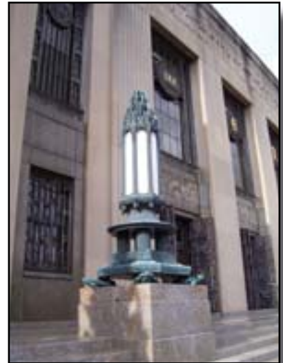
Rockland County Courthouse

For years, the New City Hamlet Center has been the focus of community concern and controversy, as well as a variety of planning and revitalization projects dating back to the 1960s. However, almost every planning initiative and strategy met significant resistance and resulted in disappointment. The Vision Plan presents and establishes a new prototype for planning in New City through an inclusive collaborative process designed to build strong consensus and a community-supported vision for the future.