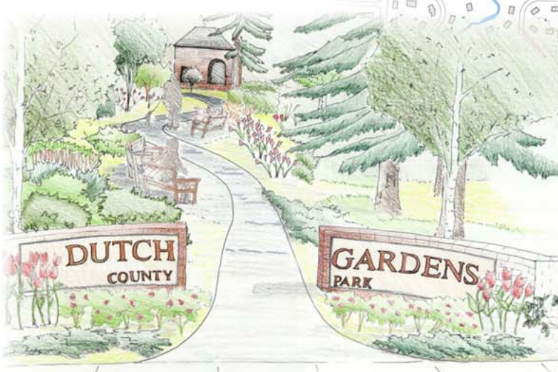
Connect the County Campus and Dutch Gardens to Main Street

Civic, Cultural, and Recreation Destinations