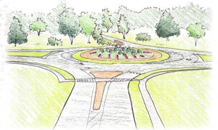
Consider new road improvements, such as a roundabout, to enhance access to South Main Street and celebrate the Southern Gateway