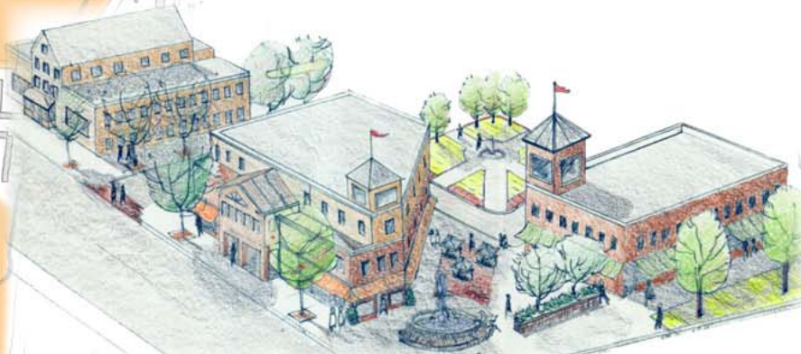
Celebrate the Central Gateway A vision of the 'signature gateway' at the intersection of Congers, Main, and New Hemstead